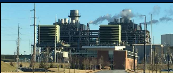
ABB Emerson Foxboro GE Hitachi Metso MHI Siemens Toshiba